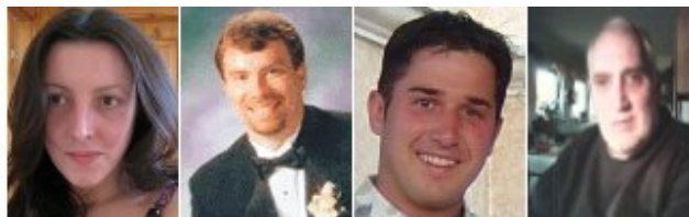
Niche Power Group